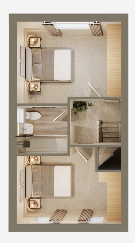
TOTAL 768 sq. ft.